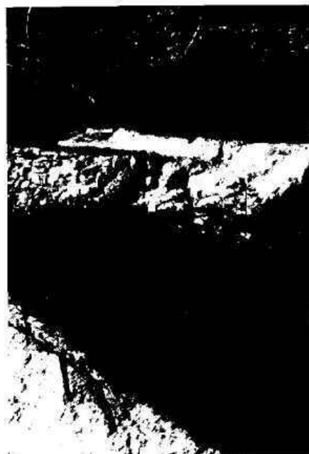
Figure 9. Garden construction techniques including thoray brush as a natural fencing material, horizontal log to form base of one terrace, hand laid stone wall and stairs carved into river bank.

guaje, guamuchil and xocote. Men sometimes hunt for small game and both men and women collect firewood in areas near the river.