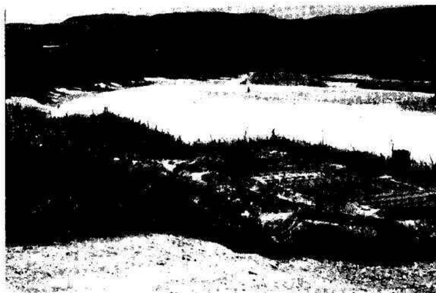
Figure 2. Exposed sandy river bed in dry season, with filtration gardens in foreground and in distance along existing stream. Water reaches the tree line during the rainy season. Note thorny branches as a fencing material, and dry hills in the background.

buckets. Informants in San Agustín Oapan told me that small water wheels ( norias ) were used in the 1940's and 50's but I did not observe this. Armillas describes the technique as humidity cultivation ( cultivo de humedad ), Niederberger (2003) calls it humidity horticulture ( horticultura de humedad ) and Del Amo, et al. (1988) refers to it as tecalli or sandy pit agriculture. I opt for the term huertos de humedad (humidity or filtration gardens) because villagers in San Agustín Oapan use the term huertos in Spanish to describe them.