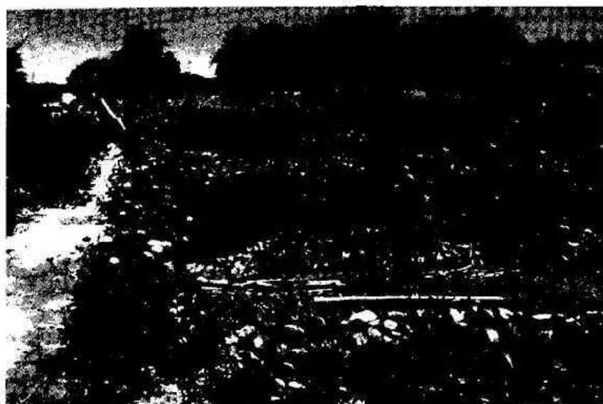
Figure 6. Mature garden with mixed plants including cilantro, epazote, camotes, amaranth, marigolds, chiles, squash and melons. Note poles, straw, stones for building terraces, sleeping shelter in upper right corner.

of the yield is sold in the neighboring villages not on the river—Ameyaltepec, Ahuehuepan and Ahuelican—where access to fresh vegetables and herbs improves the dry season diet. Another important use of the produce is in offerings made during agricultural rituals and “fiestas” for the saints, a topic I briefly explore at the end of this article.