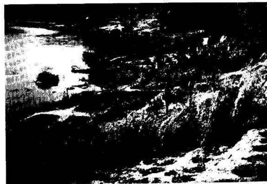
Figure 3. Group of 8-10 adjoining gardens on steep banks where the river curves. Note flat rocks placed for washing in the river, white rags tied to poles as scarecrows.

The gardens consist of flat rectangular beds built in a series of small terraces on the sandy soil. They are extended gradually in step-like fashion down to the water's edge as the river level drops throughout the dry season (figures 4 and 5). Thorny brush is cut and tied to posts to make a barrier around the gardens to keep out pigs, goats, burros and cattle. The gardening implements are simple and readily available to all—shovels, hoes, digging sticks ( coas ), machetes, buckets and gourds. The crucial resources for these gardens are labor, time and the highly specialized knowledge and experience they require. Men, women and children work together, but I observed that women's labor is essential and the gardens can be successfully cultivated by women