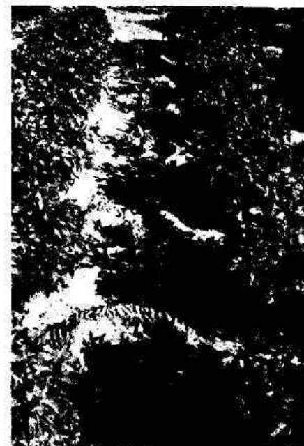
Figure 8. Hand-formed circular borders to pool water at base of bean plants, note finger marks in sandy soil.

During my fieldwork it was evident that they appreciate, sparse, clean lines surrounding the terraces and beds, and they enjoy the patterns created by spreading and climbing plants. They also derive great pleasure from the visual contrasts of lush growth with strong green hues against the white or beige sandy soil, the grey river rocks and gravel, and the dry burnt vegetation on the surrounding hills that serve as a backdrop. The amount of energy spent in the gardens is more than required for production, and these huertos and the attention lavished on them by the gardeners reminded me of Trobriand gardens. Malinowski (1984: 58-62) emphasized the importance of aesthetic considerations in the Trobriands and stressed that much more labor is invested in the plots than required for production. He discovered, as I have, that in non-western societies, in addition to providing basic foods, agricultural work