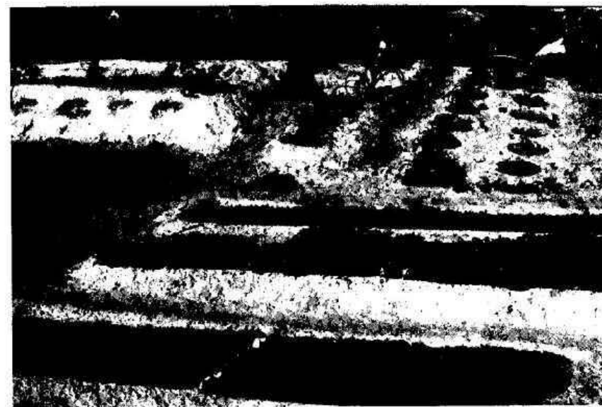
Figure 5. Horizontal beds with amaranth, onions, cilantro , yerbabuena and other greens; round pits with corn, beans, squash, melon and camotes . Note buckets with shoulder yoke for watering.

sometimes they sow seeds in smaller beds and later transplanting sprouts to the terraces.