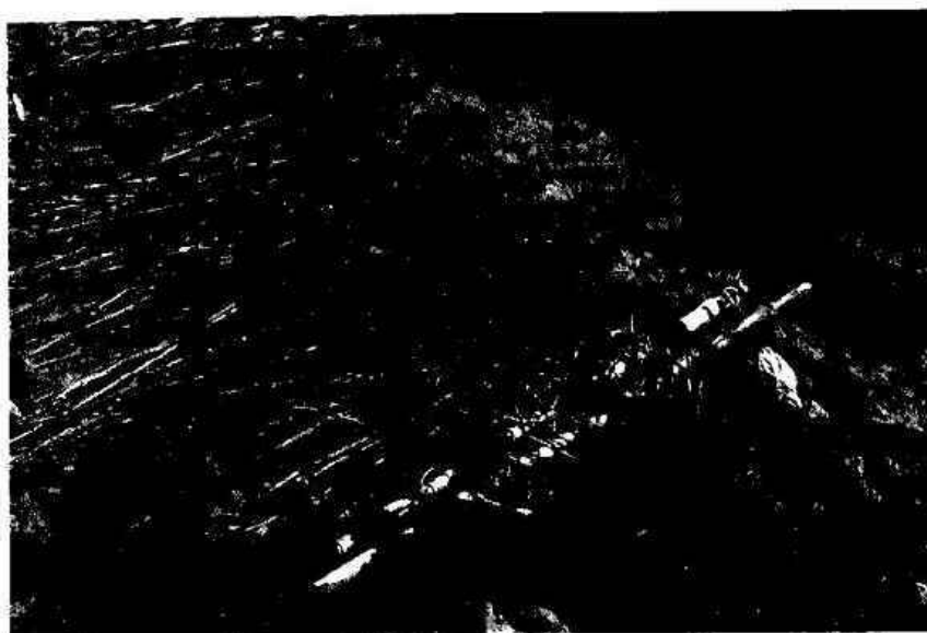
Figure 7. Watermelon and squash plants trained across wooden poles and seame straw to protect them from the hot sand.

stone walls, stairs and paths within the plots which will be flooded each year at the end of the dry season (figure 9). The layouts of the huertos are quite striking; symmetry in the arrangement of the beds (figures 5 and 2), and the contrasting heights and colors of the plants and flowers as they mature are significant consideration and the Nahuas take this into account in their planning (figure 9).